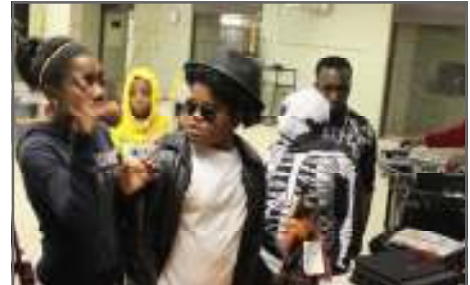
Table games, "Rock Band," and basketball are weekend favorites.